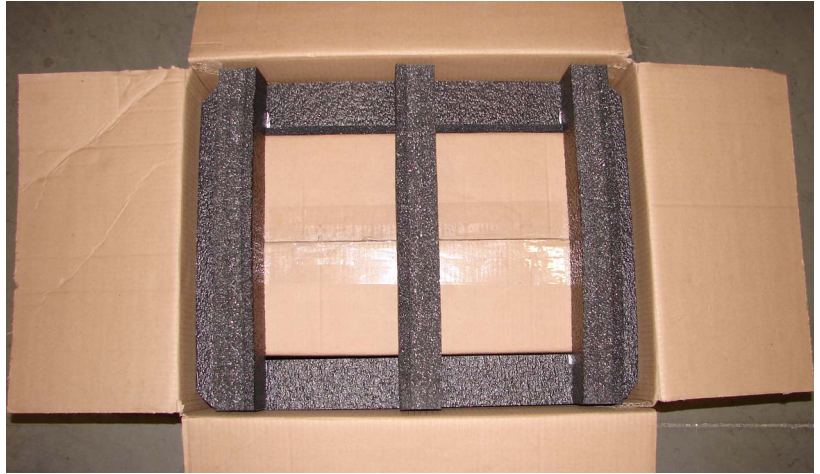
Figure 4. Top Foam Protector Inserted

NOTE: Edges of top foam protector slip down into space between cardboard sleeve and container. Three foam cross braces face up to provide extra protection during shipping.