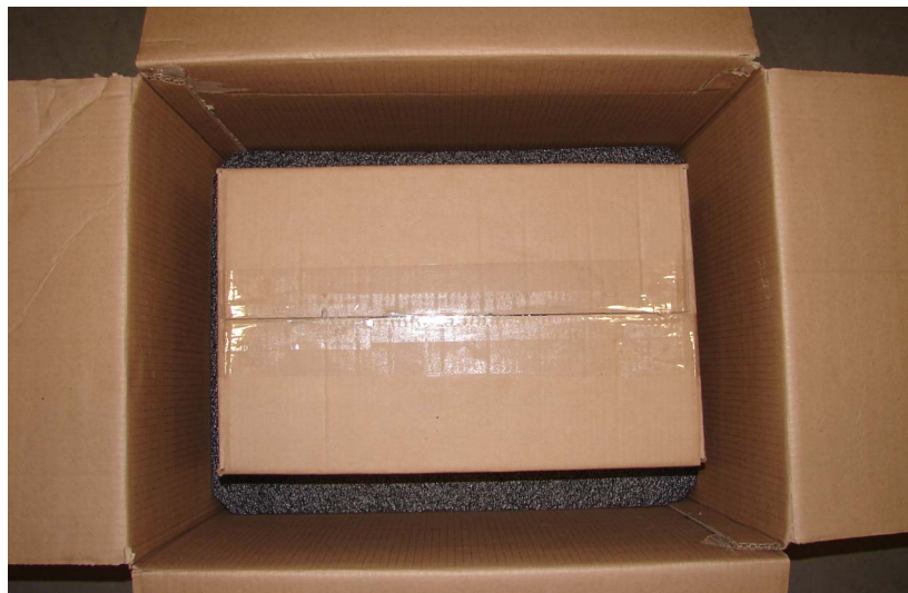
Figure 3. Cardboard Sleeve Inserted

NOTE: Cardboard sleeve slips into spaces between bottom foam protector and bill dispenser. Cardboard sleeve slides down into container. Top of sleeve should not extend above top of container.