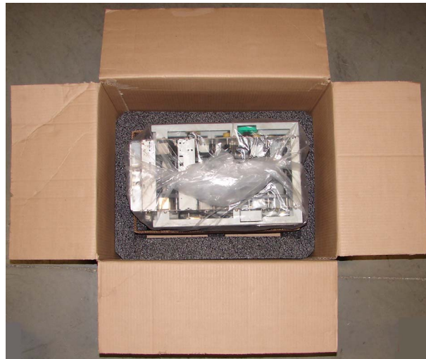
Figure 2. Bill Dispenser In Container

NOTE: Wrap bill dispenser in plastic to help shield it from dust and particles. Top of bill dispenser faces up. Bill dispenser fits snugly inside bottom foam protector and cardboard base, both of which are permanently fastened inside container. Do not attempt to remove bottom foam protector and cardboard base.